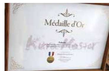
Left: The certificate of merit received when Fuku no Tsuyu took the gold medal at a shochu competition in 1937. Center: One of the barrels filled with shochu that can be seen all over the expanded distillery building. Right: Another certificate of merit, this one from the French Kura Master spirits competition.