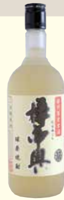
A gentle aroma of sweet vanilla