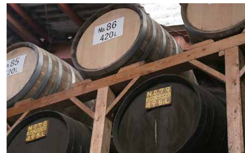
Sherry and oak barrels line the shochu storehouse, filling the air with a sweet aroma. Once blended, the heads of the distillery, along with the entire staff, hold tastings to determine the optimal flavors to refine in each batch.