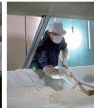
Upper left: Site of the Fukuda Shuzo Experience program, you can take a guided tour with a toji and see shochu barrels being blended. Upper right: Initial prep underway in an enameled metal tank. Left: Every shochu here is made using rice grown in western Japan and white koji. Right: As the number of Kuma Shochu distilleries declines, machinery is introduced to handle automatable tasks. Rice is washed, soaked, and seeded with koji spores in a drum, before it is moved to a triangular rack and turned to koji.